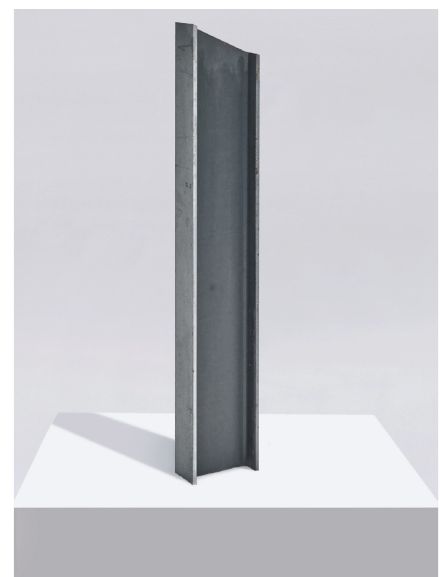
IPE 120 - TF007

From: the Storage facility of an automobil fabric workshop in Uster