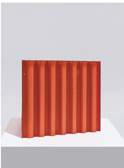
Aluminium Corrugated Plates - ZD004

It is through thinking together across disciplines and beyond current systems that we can start the much-needed revision in existing mindsets and processes related to our built environments. With the Basel Pavillon we aim to inspire a transformation that will instigate meaningful, lasting change in the long-term and a sharing of voices, visions and perspectives in the present.